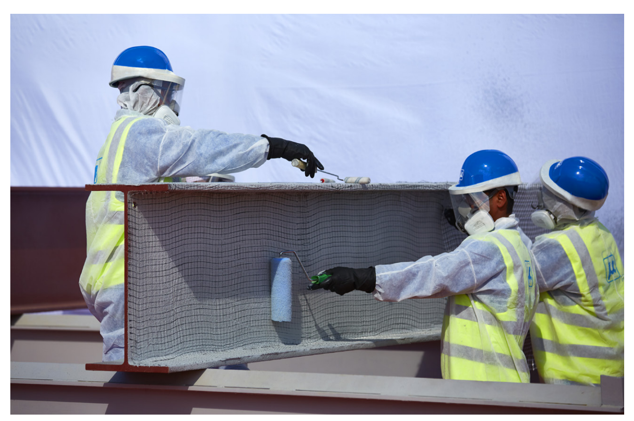
Application of passive fire protection on steel beams

For more information about additional opportunities and risks, please see our detailed explanations in the 2016 Annual Report.